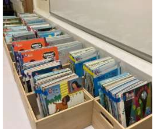
A small selection of the new books to take home from next week