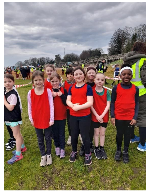
Year 3 Girls