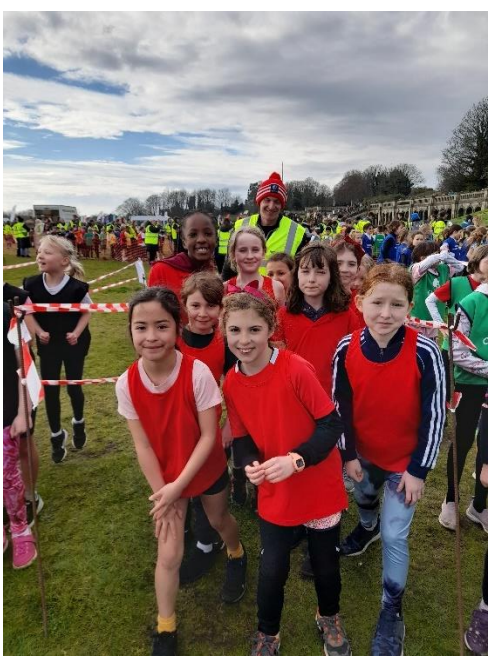
Year 4 Girls