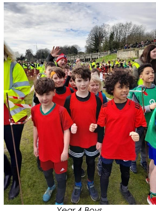
Year 4 Boys