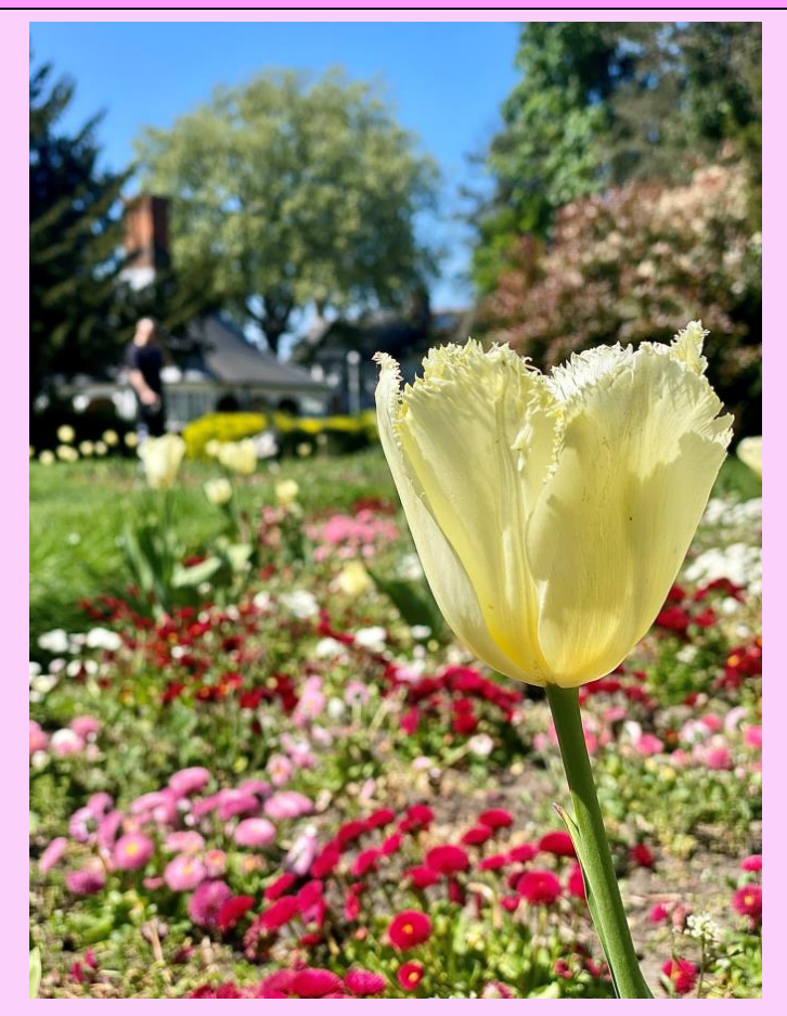
WINNER: Amelia Whittle