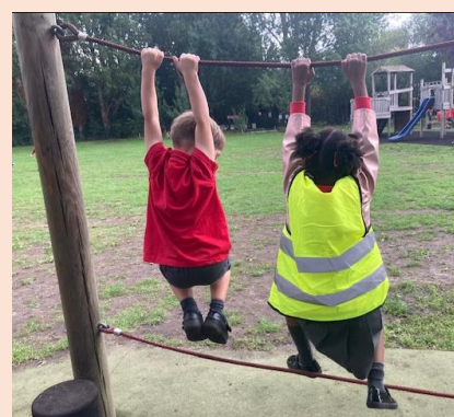
Friday fun this lunchtime

Please remember - parents and carers are responsible for their children using the equipment before and after school.