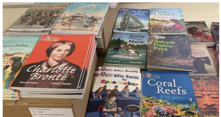
Exciting new fiction and non-fiction titles