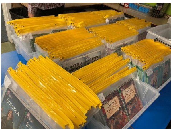
Just ¼ of the books for Years 5 and 6