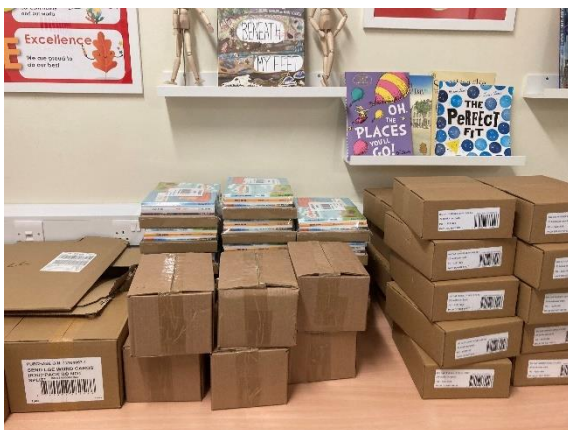
ARC and Year 3 and 4