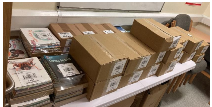
Early Years to Year 2